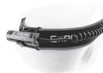
Support Cell - See Below